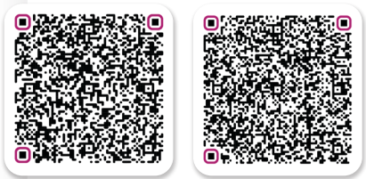
CALGARY WEST CAMPUS | CALGARY NORTH-WEST